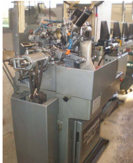
M7 Automatic Sliding head Machines