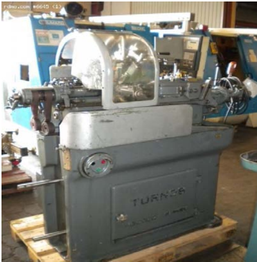
R10 Automatic Sliding head Machine