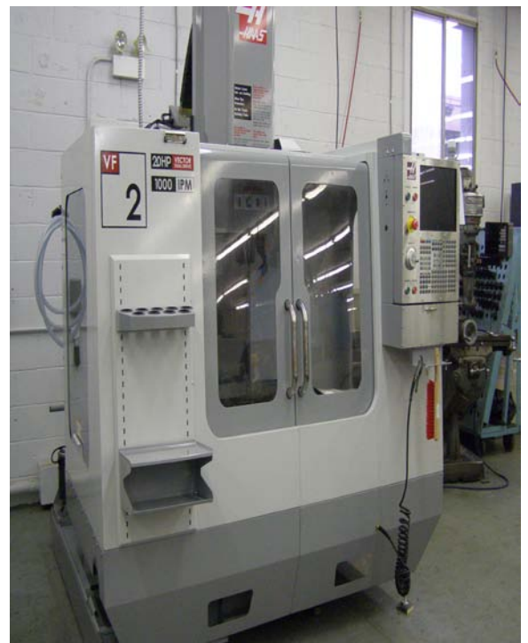
(Vertical Maching Centre ( HAAS Make 20 Tools , 40 Tools Capacity )