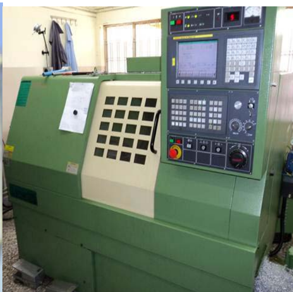
LMW Smartturn Machine