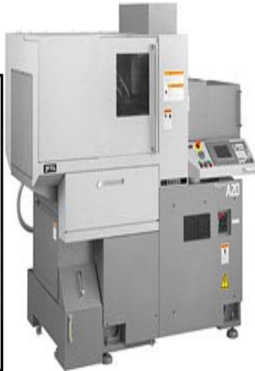
CNC Sliding Head Stock Machine (A20 VII PL)