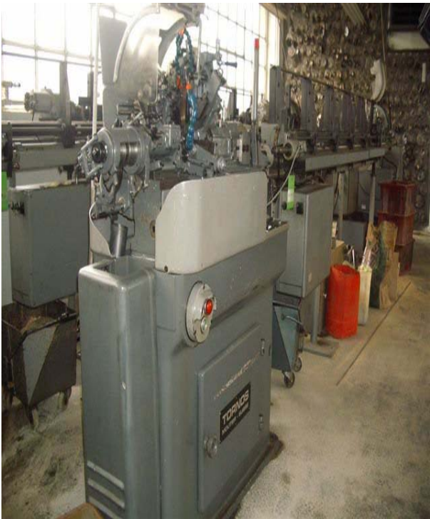
RR20 Automatic Sliding head Machine